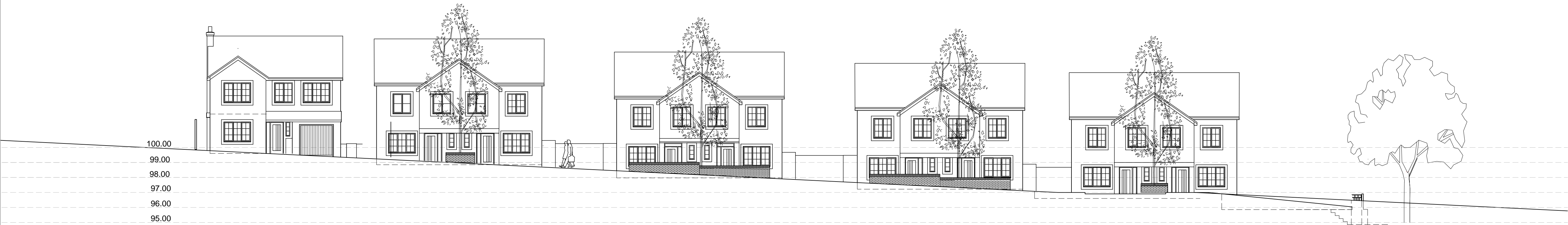
South West street scene A-A